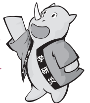
Gakkensai Character: Sai-chan

During educational and research activities... refers to times during which you are taking classes, participating in school events, etc. See below for details!